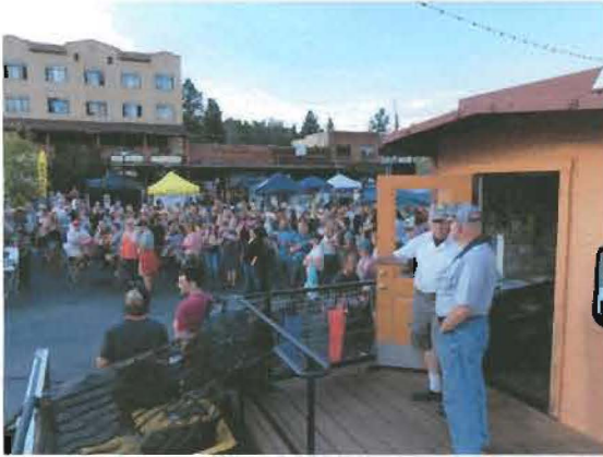
Truckee Thursday at the Museum

The caboose museum has four weekend shifts - Saturday and Sunday mornings from 10 am to 1 pm and afternoons from 1 pm to 4 pm. The morning Docents open the Caboose at 10 am and the afternoon docents close it at 4 pm. The stuff in between is fun and simple.